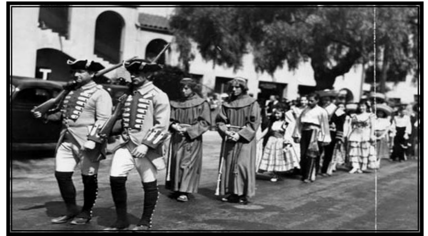
1936 Revelers re-enacting the founding of Los Angeles!

Join us at 6:00 a.m. for a brief welcome from the San Gabriel City Council.